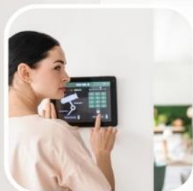
Security Home & Away

Custom smart home products & design on any budget.